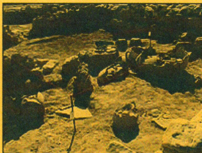
The factory is thought to have been part of a complex